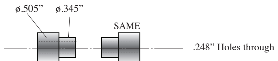
Diagram C / Bushings #PK50RBU