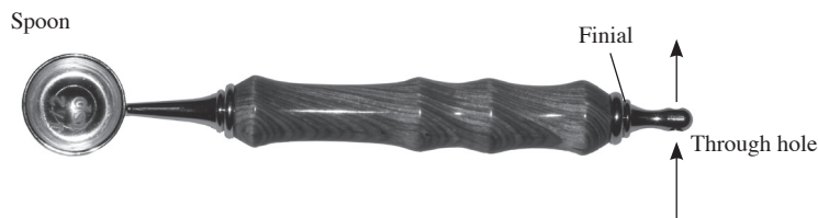
Diagram D / Bushings #PKMSPBU